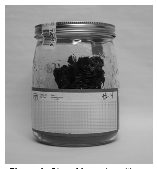
Figure 3 : Glass Mason jar with fire debris.