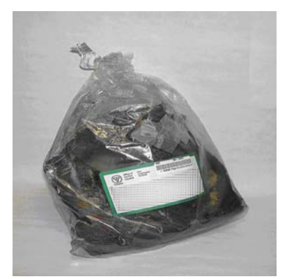
Figure 4 : Speciality nylon bag with swan neck seal.

Note : After purchase, Mason jars and lids must be washed in hot water, withou t soap. Prior to use, they must be stored with the lids on, and away from all potential sources of ignitable liquid or other contaminating sources.