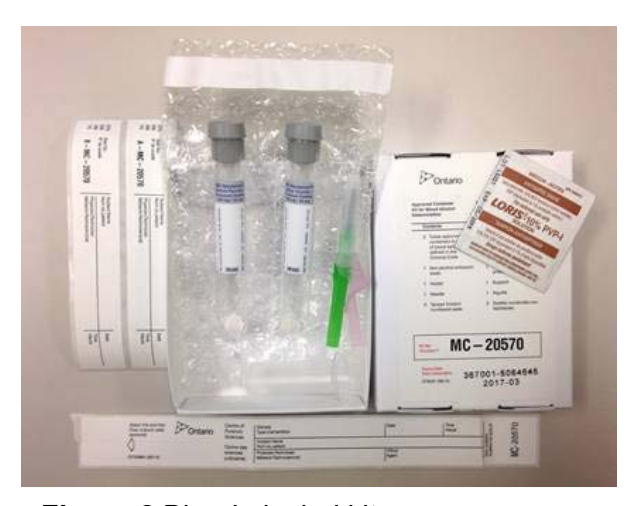
Figure 2 Blood alcohol kit