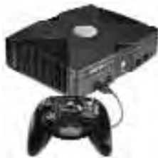
Xbox® gaming console