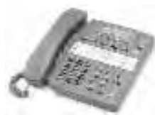
No tape (digital)