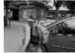
Mobile antenna hidden in a backpack for the purpose of detecting wireless network.