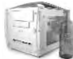
Ice Cube: Small personal computer with carry handle