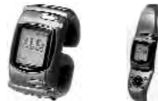
A standard cell phone incorporated into a wrist watch