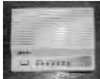
External fax modem