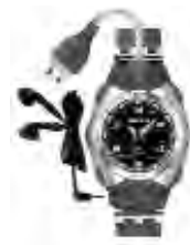
MP3 player/watch with USB cable