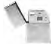
Camera lighter: Digital camera incorporated into the body of a lighter. Features include high-resolution digital still camera with internal memory, a surveillance feature that records images at preset time intervals, and video recording with sound.