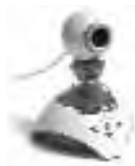
Webcam: Camera that interfaces with a computer to transfer live images.