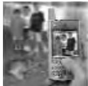
Integrated cell phone, PDA with e-mail, text messaging, Web browsing, and digital camera