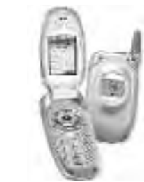
Traditional cell phone with scheduling features